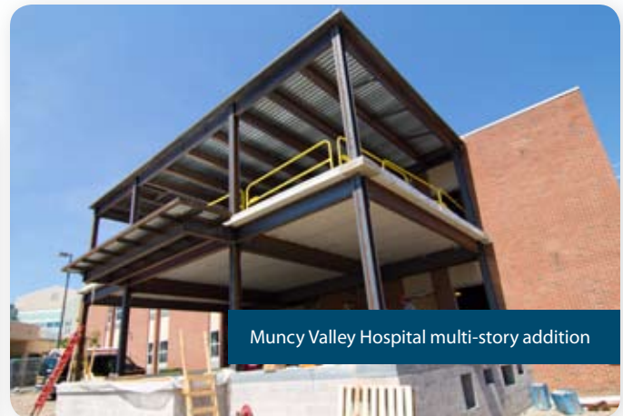
Muncy Valley Hospital multi-story addition