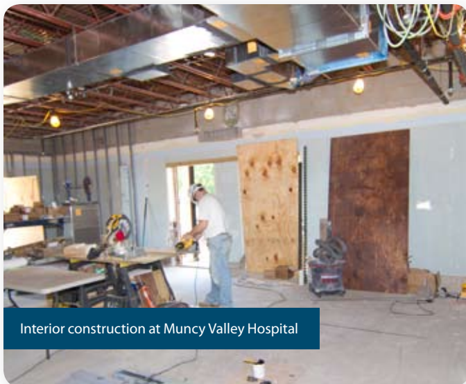
Interior construction at Muncy Valley Hospital