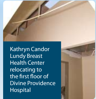
Kathryn Candor Lundy Breast Health Center relocating to the first floor of Divine Providence Hospital