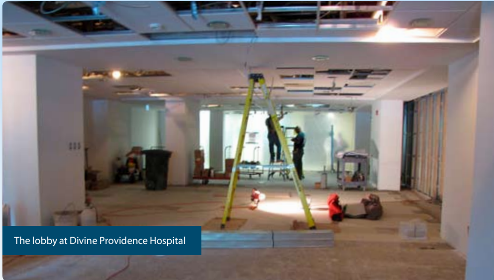
The lobby at Divine Providence Hospital