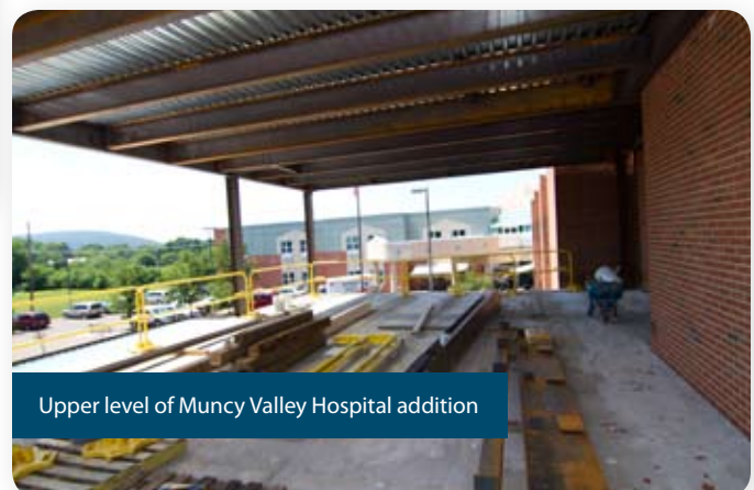
Upper level of Muncy Valley Hospital addition